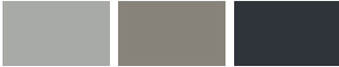
RAL 9006 White Aluminium RAL 9007 Grey Aluminium RAL 7016 Anthracite Grey

PVDF is characterised by an excellent colour fastness. Furthermore, a good resistance to chemicals is provided by PVDF coating.